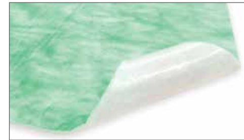
Surgisafe Absorbent Floor Mat with a fluid barrier non-slip backing