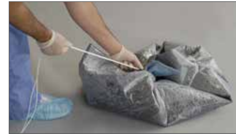
A Cinch Mat showing usage of the draw string cord